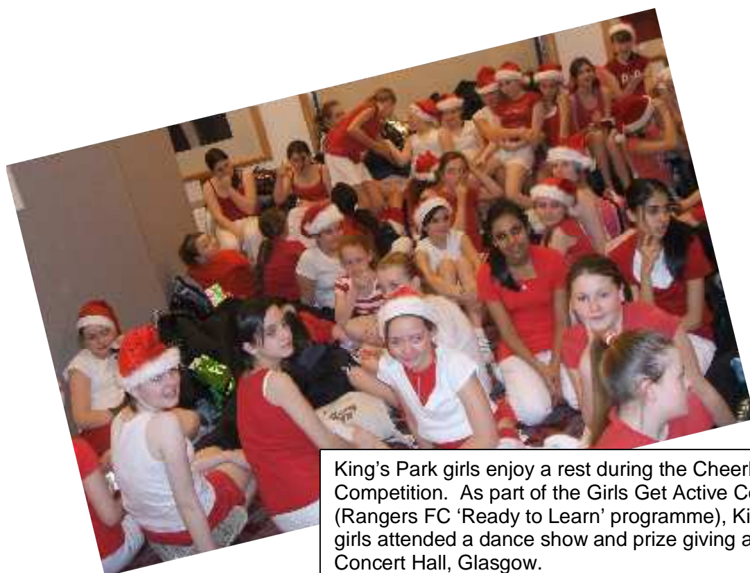
King's Park girls enjoy a rest during the Cheerleading Competition. As part of the Girls Get Active Course (Rangers FC 'Ready to Learn' programme), King's Park girls attended a dance show and prize giving at the Royal Concert Hall, Glasgow.