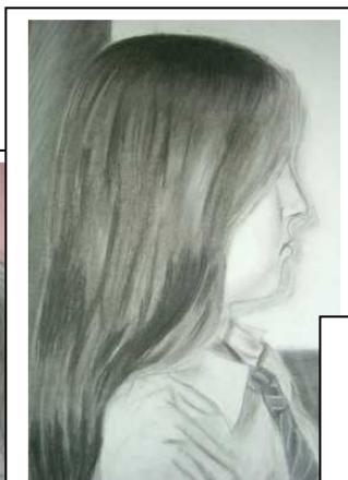
... 4F2 Portrait 2