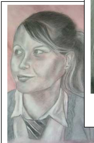
... 4F2 portrait