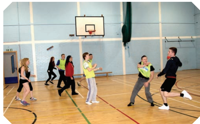
Sports and Recreation Class 2013

See relevant job profiles at PlanIT Plus website www.planitplus.net