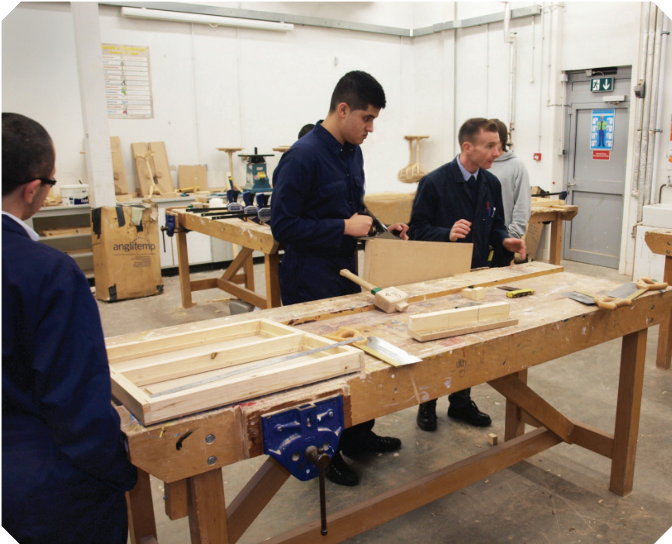
SFW Construction Class - 2013