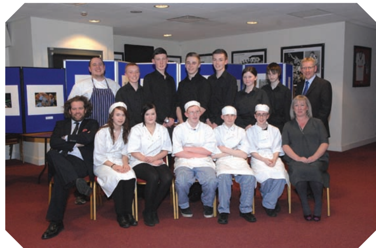
Commercial Culinary Arts Banquet

This qualification will compliment your school portfolio.