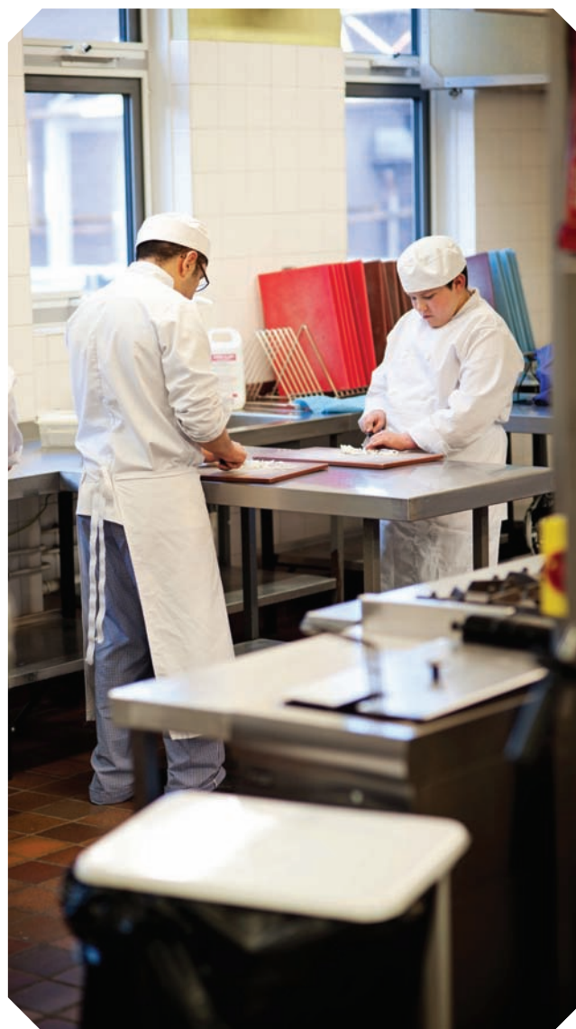
Grow, Cook & Eat 2013

Places are limited for S4 pupils and must be discussed with the school guidance teacher. Vocational courses are challenging, flexible and offer plenty of scope to suit different preferred learning styles. They are ideal for pupils who want to leave school at the end of S4.