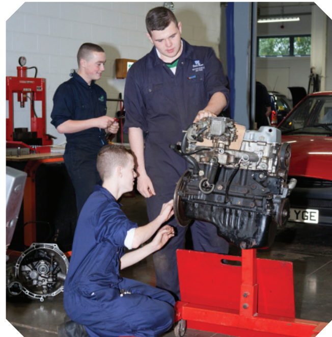
Vehicle Maintenance Class 2013

See relevant job profiles at PlanIT Plus website www.planitplus.net