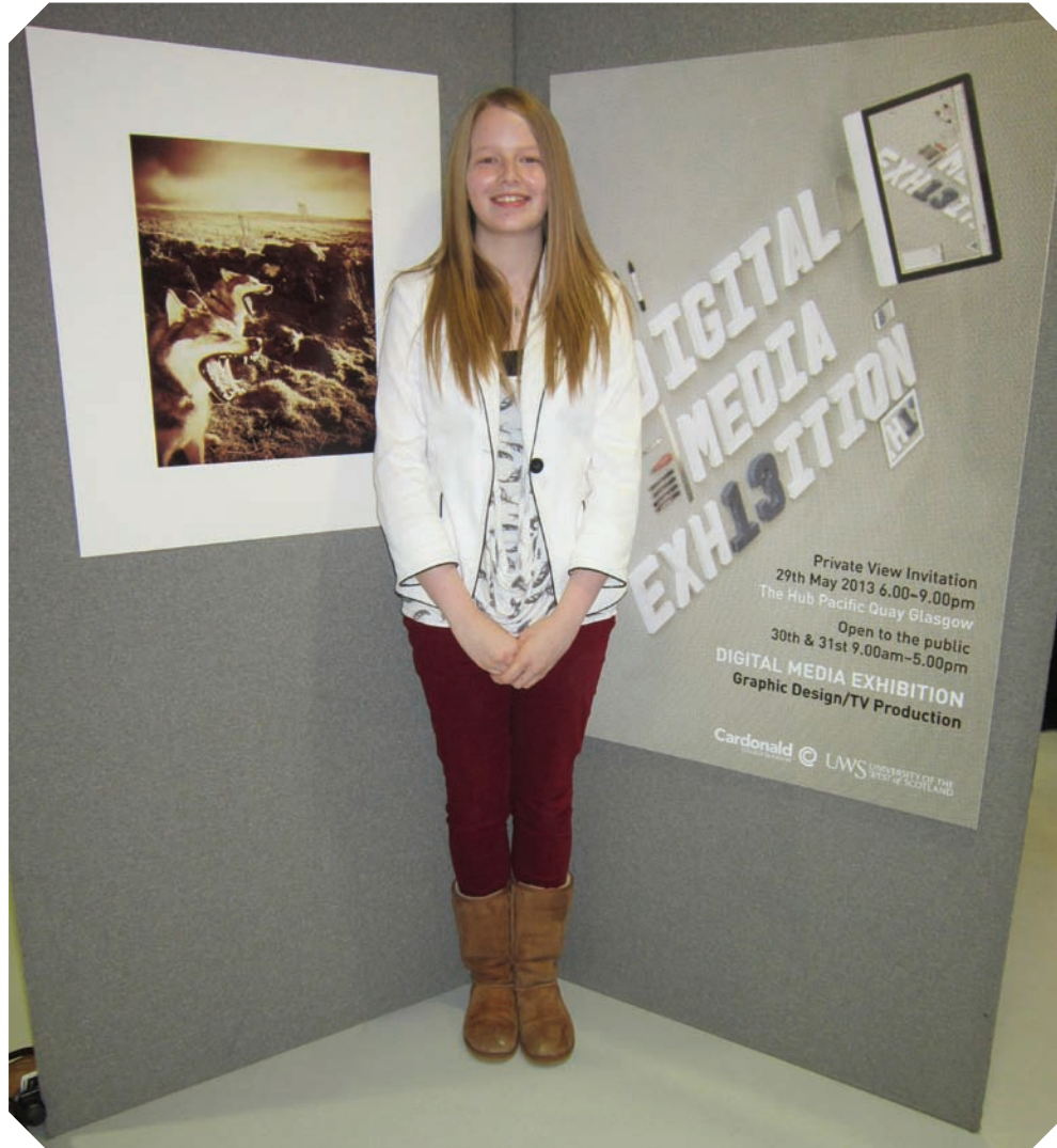
Eilidh Elizabeth School's Award for best Higher Photography Photograph – 2013