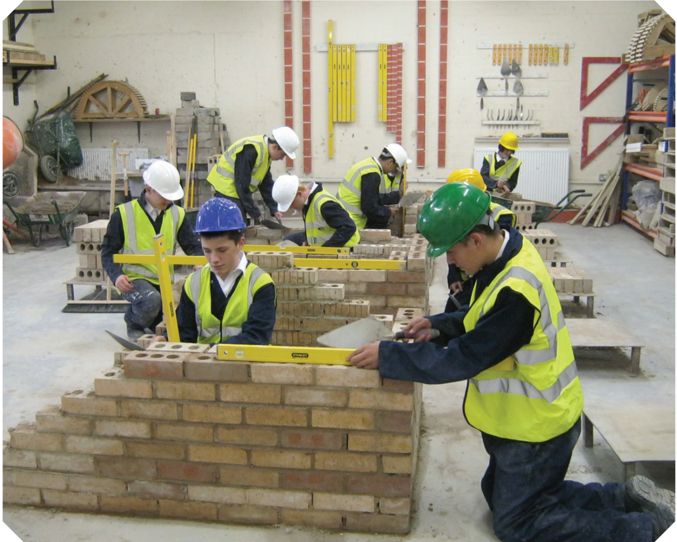
NPA Construction Class - 2013