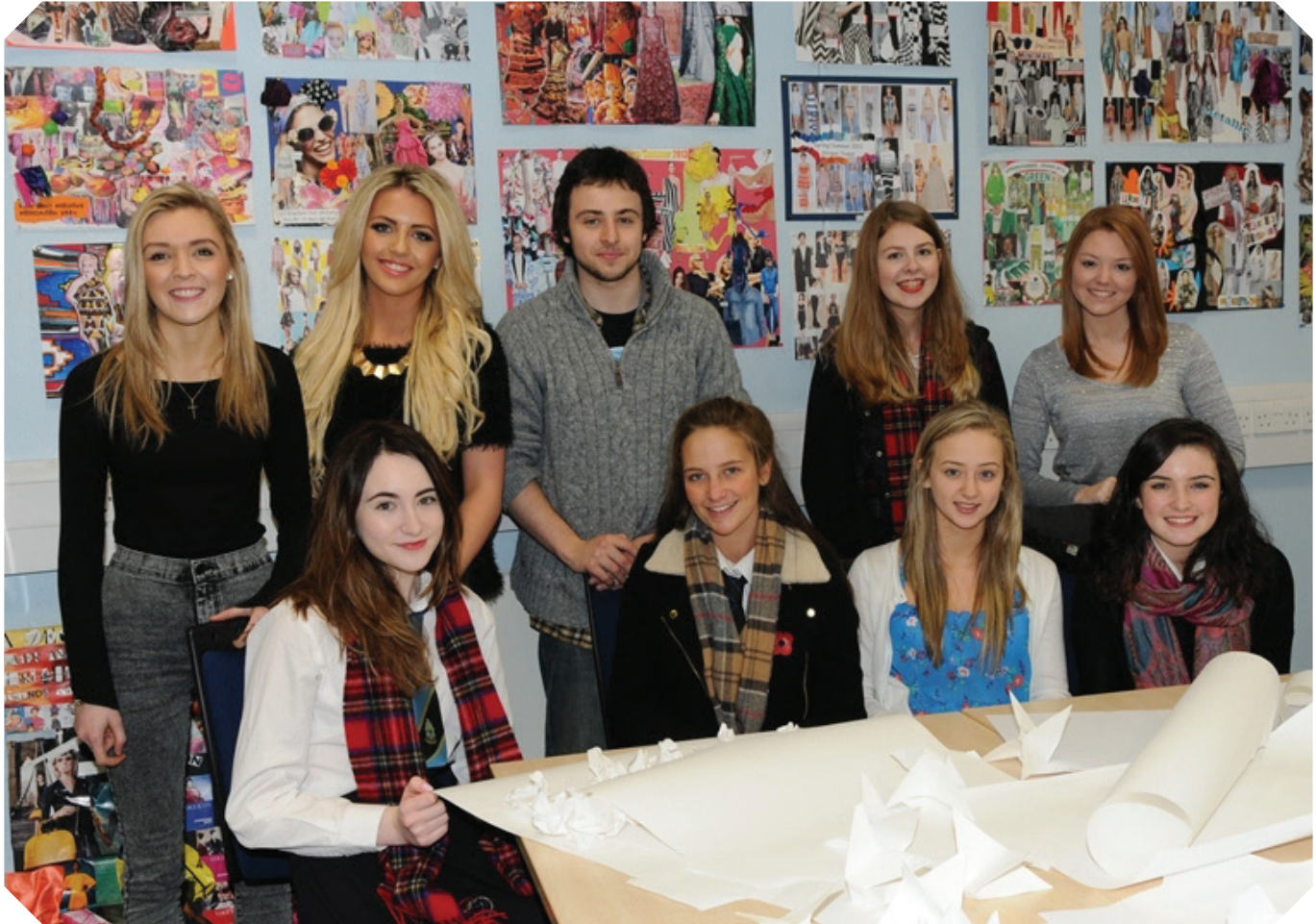
Fashion Brand Retailing Class 2013