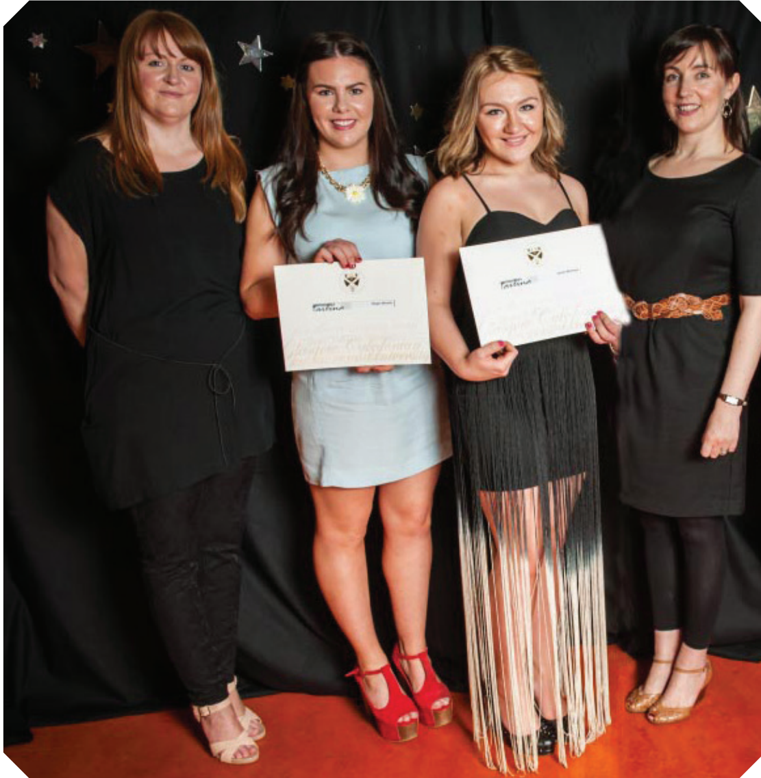
Fashion Brand Retailing Class of 2012, Graduation Ceremony