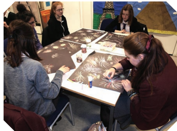
Early Education and Childcare Class of 2013

See relevant job profiles at PlanIT Plus website www.planitplus.net