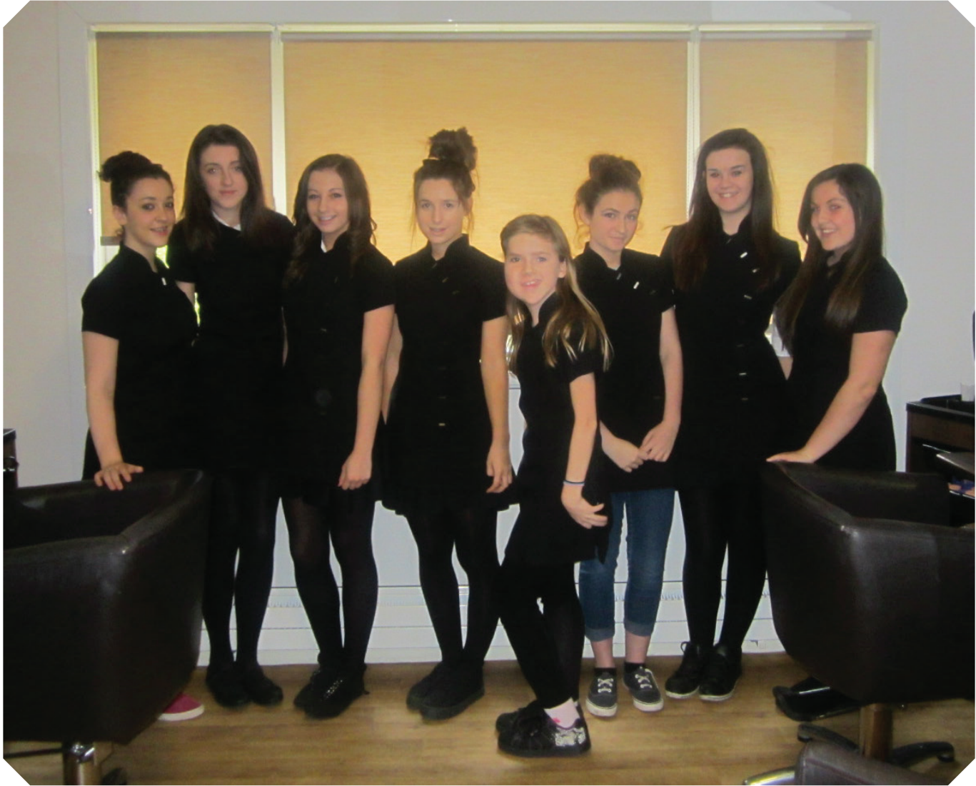
Style for Success , Eastwood High School 2013